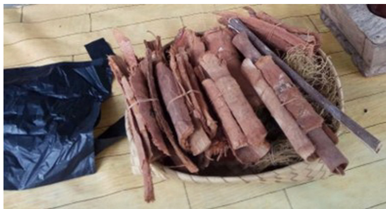
Figure 1. Sterculia quadrifida bark is sold in traditional markets in Kupang city.

Sterculia quadrifida bark is sold in traditional markets in Kupang without post-harvesting treatment (Figure 1). Raw herbal materials risk fungi contamination, have limitations in transportation and have low economic value (Li et al., 2015; Setiarso, Rusijono & Kusumawati, 2018; Singh, Tiwari, Maurya, Kumar, & Dubey, 2022). Moreover, the decoction has a woody aroma and chelate taste. Some ingredients are commonly added to herbal drinks, including stevia leaves ( Stevia rebaudiana B.), ginger ( Zingiber officinale Rosc.), and mint ( Mentha piperita L.) This study processed the bark into tea bag packaging