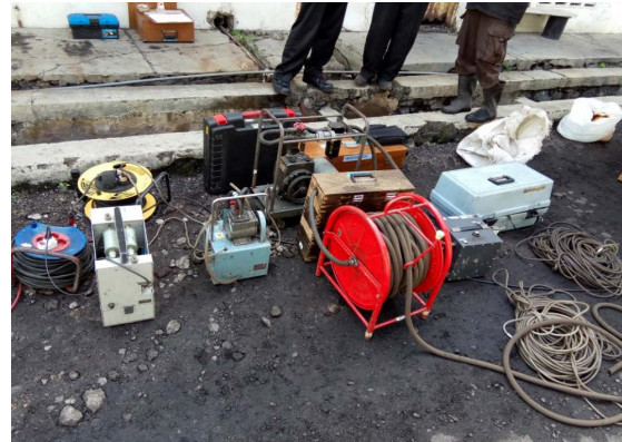
Figure 1. Particulate Emission Measurement Equipment

equipment used for measurement includes nozzles, pumps, barometer, and filter. The equipment can be seen in Figure 1.