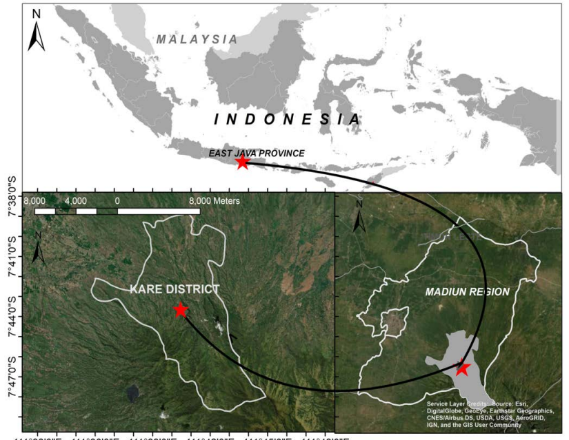
111°33'0"E 111°36'0"E 111°39'0"E 111°42'0"E 111°45'0"E 111°48'0"E

Data from Setiahadi (2017) were used to examine the effect of stand density and species diversity on timber production and carbon stock in the location. The data were collected using the quadrat method. The sample plot's shape was square with a size of approximately 25 m