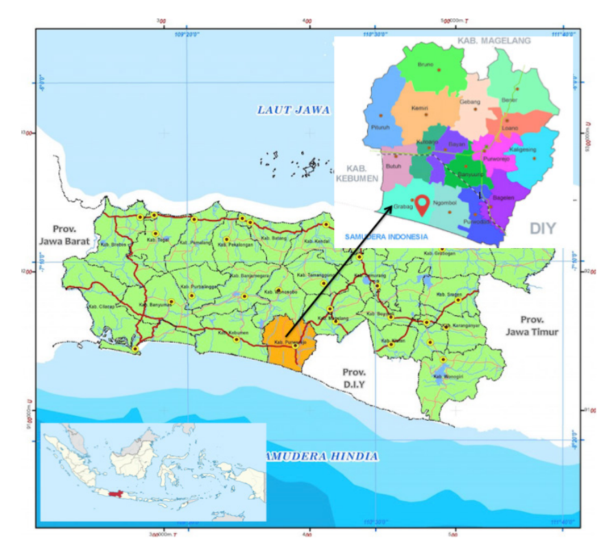
Figure 1. Site location

The research was conducted from 2016 to 2019 in Patutrejo Village (7°50'46.1"S, 109°53'55.4"E), Purworejo Regency, Central Java (Figure 1). The research location was in a coastal area within \pm 500 m of coastlines. The site soil was checked at the Jenderal Soedirman