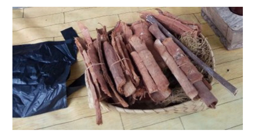
Figure 1. Sterculia quadrifida bark is sold in traditional markets in Kupang city.

Sterculia quadrifida bark is sold in traditional markets in Kupang without post-harvesting treatment (Figure 1). Raw herbal materials risk fungi contamination, have limitations in transportation and have low economic value (Li et al., 2015; Setiarso, Rusijono & Kusumawati, 2018; Singh, Tiwari, Maurya, Kumar, & Dubey, 2022). Moreover, the decoction has a woody aroma and chelate taste. Some ingredients are commonly added to herbal drinks, including stevia leaves ( Stevia rebaudiana B.), ginger ( Zingiber officinale Rosc.), and mint ( Mentha piperita L.) This study processed the bark into tea bag packaging