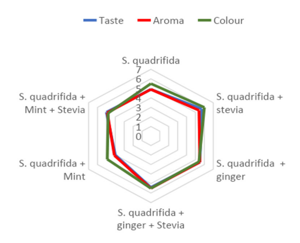
Figure 3. The radar chart shows the overall acceptance of S. quadrifida herbal tea formulas

another study showing that heavy metals in the herbal materials were below the required limits (Keshvari et al., 2021). A study showed lead, mercury, and cadmium contamination in herbal medicine, but within considerably safe limits (Wang, Wang, Wang, Li, & Li, 2019). S. quadrifida bark in this study was obtained from locations far from residential areas and roads. Therefore, the trees were not exposed to heavy metals pollution from human activities.