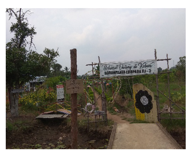
Figure 2 Rajati Flower Garden ecotourism Gambar 2 Ekowisata Rajati Flower Garden.